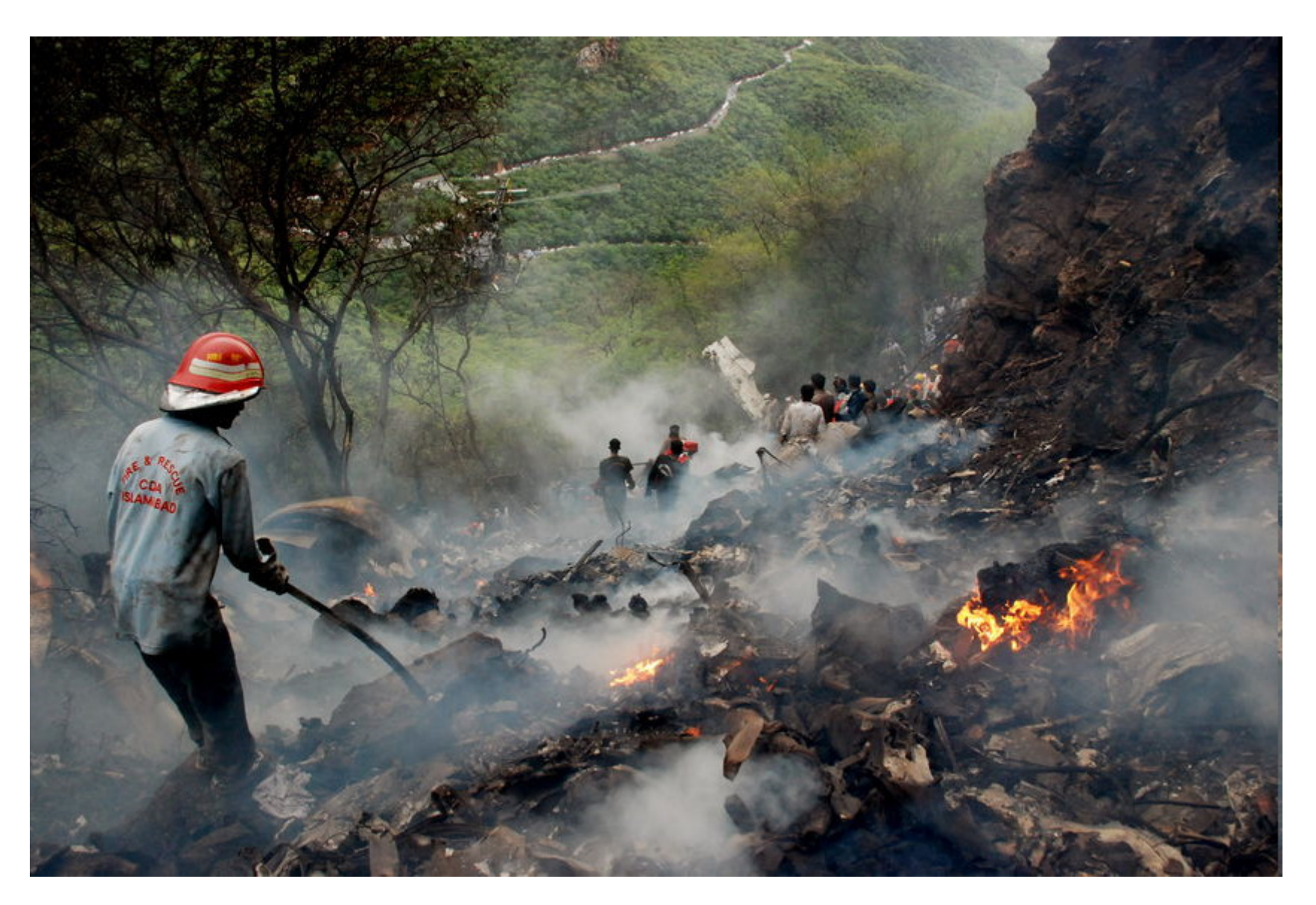
Rescue workers search the site of the crash of an Airblue passenger plane on the outskirts of Islamabad, Pakistan Wednesday.