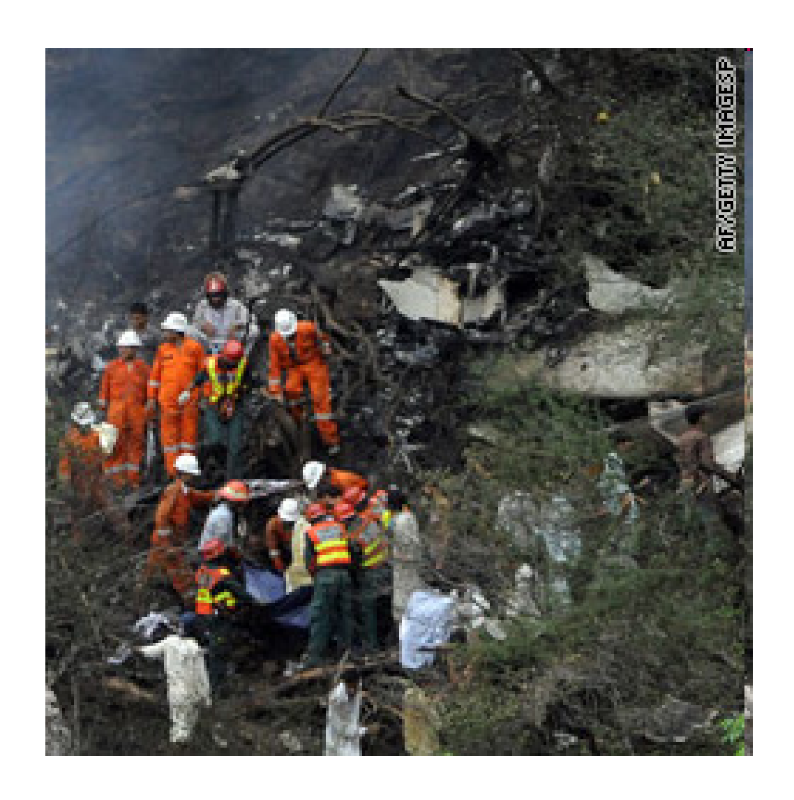
No survivors in Pakistan plane crash