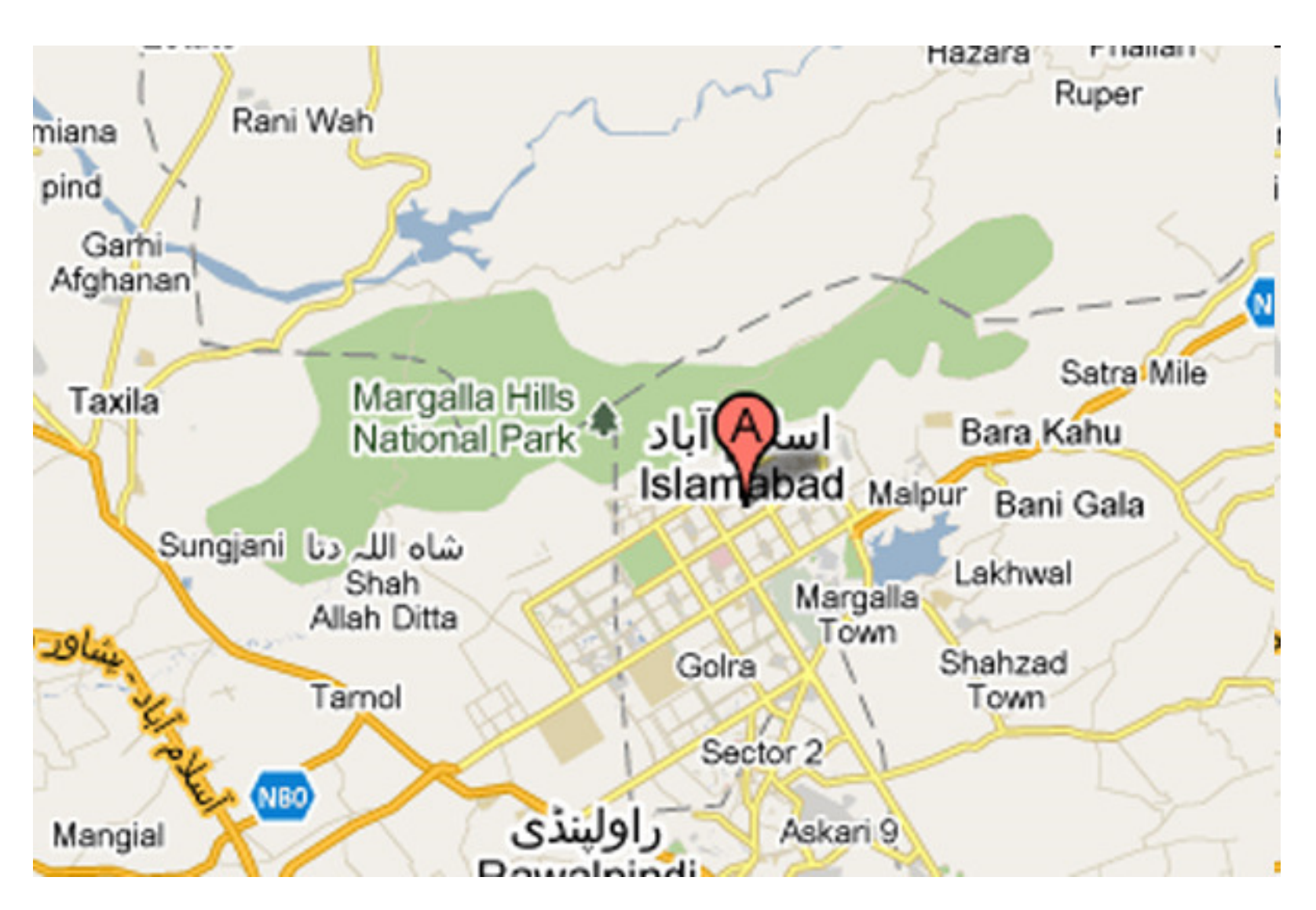
Location of Margalla Hills in Pakistan's capital Islamabad.